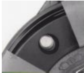
22mm Wheel Bolt

The clearance between the drum hole and the wheel bolt (when the smaller bolt is used) is not a problem because the drum is centered by the hub pilot. The drum is held in place when the wheel is torqued against the drum. When proper mounting hardware is used and wheel torque's are maintained (see reverse side for proper torque's), the drum will be secure on the hub.