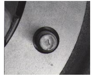
3/4" Wheel Bolt