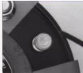
1-1/8" Wheel Bolt