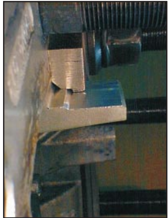
New, step pilot drum design.